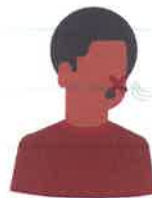
loss of taste or smell