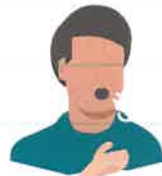
Shortness of breath or problem breathing